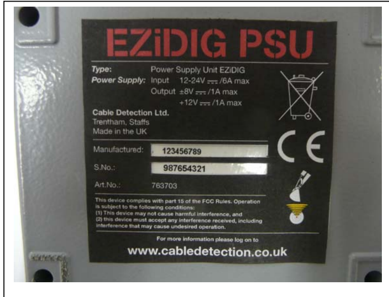
Rating Plate located on underside of unit